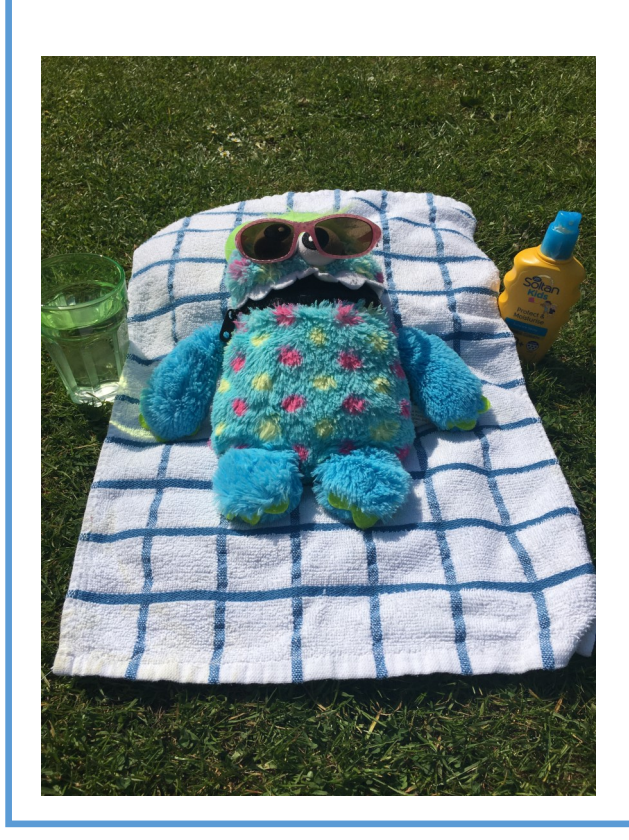
Enjoying the sun.