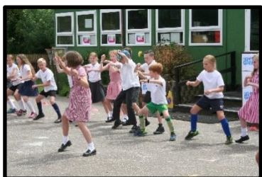
The Hakka is performed ferociously.