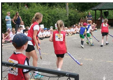
The whole school watch on, hoping their house wins.

Registered a School Games Day date on your dashboard on www.yourschoolgames.com