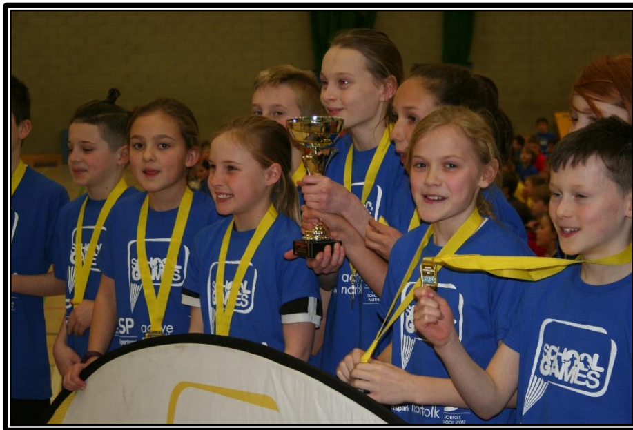
2018 School Games Sportshall Athletics Year4-6 County Champions