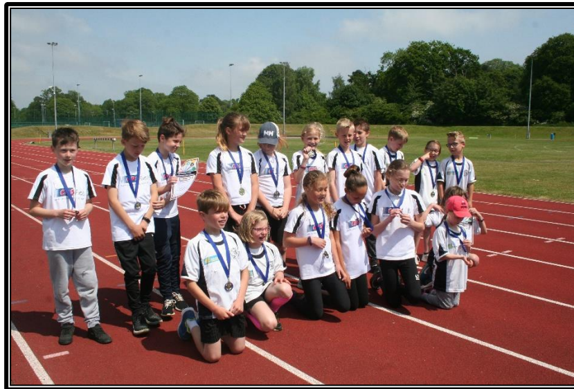
Wreningham Year 3-6 Quad Athletics Teams South Norfolk All Schools South Norfolk Champions 2018