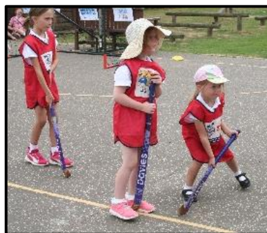
Our youngest children are picking up the skills for the future.