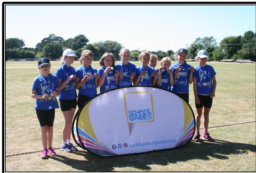
Wreningham Girls Kwik Cricket Team 2018 School Games All Schools Girls Cricket Silver Medallists