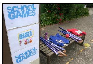
The equipment is laid out by the Sports Crew